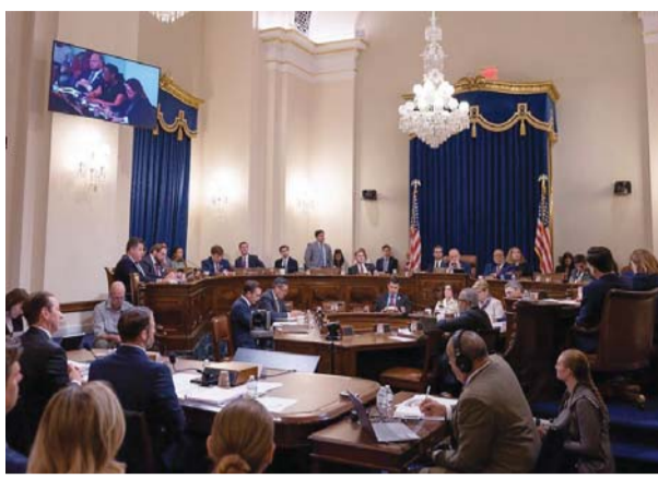
Johnson, R-La., of the bill. "We have to fund border security and immigration enforcement, and it's sad that Republicans have to do it on our own."

nearly $1.8 billion fund to compensate allies of the president who claim they have been unjustly investigated and prosecuted. Those proposals proved politically toxic and were scrapped. Now, the bill is focused entirely on immigration enforcement, a topic that Republicans have treated as a defining issue between the two major political parties and one they hope will carry them to victory in this year's midterm elections. The bill provides $38 billion for Immigration and Customs Enforcement, $26 billion for the Border Patrol and another $5 billion to cover unforeseen costs, fuelling Trump's deportation agenda. "It's long overdue," said