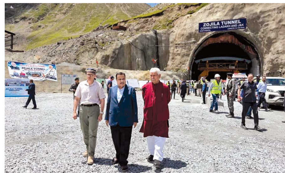
J&K LG Manoj Sinha with Union Minister Nitin Gadkari and CM Omar Abdullah during the inspection and breakthrough ceremony of Zojila tunnel at Minamarg in Ladakh

The tunnel is likely to be thrown open to the public in February 2028, the officials