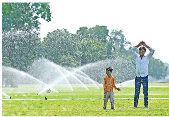
Father-son duo beat the heat under lawn sprinklers near India Gate as temperatures soars in New Delhi.