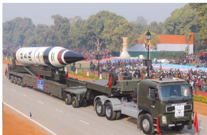
Agni-V Missile passes through the Rajpath during the full dress rehearsal for the Republic Day Parade-2013

The Stockholm International Peace Research Institute, on Monday, made public its SIPRI Yearbook 2026 and said approximately 4,012 nuclear warheads remain deployed with missiles