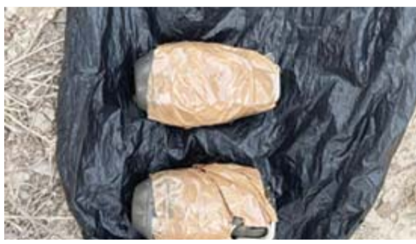
acting on their instructions.