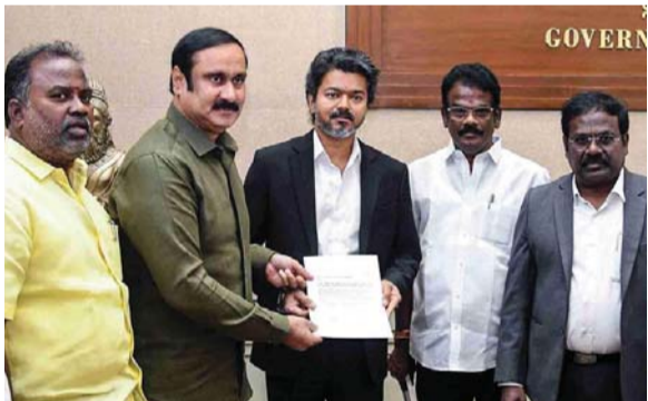
TN Chief Minister Joseph Vijay with Pattali Makkal Katchi MP Anbumani Ramadoss during a meeting at Chief Secretariat in Chennai

Ramadoss met CM Vijay at the Secretariat and handed over a letter, a copy of which was later released to the media. In a letter addressed to Vijay, he said, "Tamil Nadu alone has gone beyond the usual 50 per cent cap and has