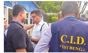
CID officials at TMC central party office-cum-residence of Mamata Banerjee

A CID entered the Trinamool Congress (TMC) chief Mamata Banerjee's home and party office at 30B Harish Chatterjee Street in Kalighat on Tuesday afternoon with a search warrant after a brief standoff with security personnel and a party leader, as a part of its probe into the controversy surrounding alleged forged