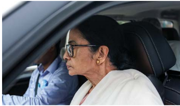
TMC supremo Mamata Banerjee departing from the residence of Congress MP Sonia Gandhi after a meeting in New Delhi

The meeting followed after Gandhi, the chairperson of the Congress Parliamentary Party, and Banerjee met each other warmly with a hug at the opposition bloc's meeting here on Monday. The Congress