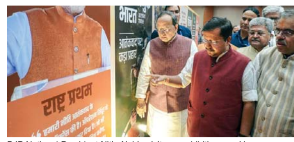
BJP National President Nitin Nabin visits an exhibition, marking completion of 12 years of the NDA Government at party headquarters in New Delhi on Tuesday