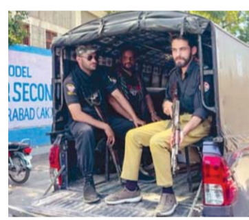
Police officials patrol an area amid the ongoing violence in PoK, where 11 people were killed and hundreds injured during violent clashes

India's comments came as reports pointed to fatalities and