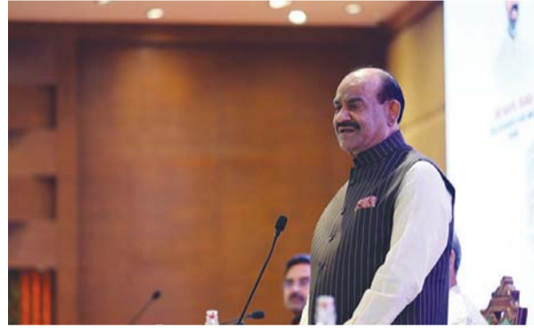
Lok Sabha Speaker Om Birla Addressing the Valedictory Session at the 2nd Annual Conference of the Zone-II, Commonwealth Parliamentary Association (CPA) India Region in Chandigarh

Addressing the valedictory ceremony, Lok Sabha Speaker Om Birla stated that frequent interruptions and disruptions in the Houses pose a serious challenge to democratic institutions. He underlined that the solution to this problem lies within the legislative institutions themselves by promoting conduct aligned with public expectations, dialogue, and meaningful discussion. Strengthening public trust is the greatest responsibility of all public representatives today. He called upon the public representatives to ensure that their conduct in legislative institutions is exemplary so that the welfare of the last person in