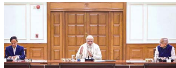
Prime Minister Narendra Modi chairing a meeting