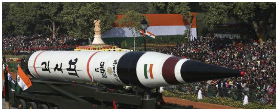
India's Nuclear Arsenal Grows to 190 Warheads Amid Strategic Readiness Shift

The report highlights the increasing role of nuclear-powered ballistic missile