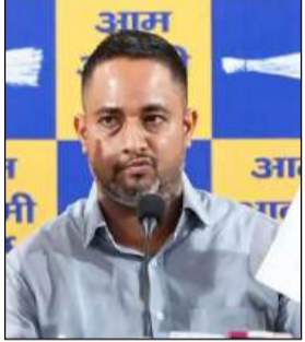
और तीन जून को प्रस्तावित चुनाव को बिना निर्धारित प्रक्रिया अपनाए अनिश्चितकाल के लिए स्थगित कर दिया गया। उन्होंने कहा कि डीएमसी

एजेंसी नई दिल्ली। दिल्ली नगर निगम (एमसीडी) की वार्ड कमिटीयों और स्थायी समिति के चुनाव को बार-बार टालने को लेकर आम आदमी पार्टी (आआप) ने निगम पर तीखा हमला बोला है।