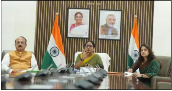
या संकोच नहीं होना चाहिए। स्कूलों में ऐसा वातावरण बनाया जाए जहाँ वे खुलकर अपनी समस्याएँ साझा कर सकें और उन्हें मानसिक दबाव से बाहर निकालने में मदद मिले। बैठक में मुख्यमंत्री ने स्कूलों के