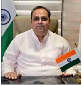
ऑपरेशनल तैयारी में मदद करेगा। उन्होंने कहा कि प्रस्तावित व्यवस्था के तहत स्वीकृत जीसीसी दरों पर होने वाला ऑपरेशनल खर्च डीटीसी उठाएगा, जबकि जीसीसी प्रैक्टिस से ज्यादा होने वाले खर्च के लिए एनटीपीसी के सीएस सहव्यता फंड