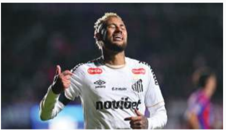
NEW DELHI. (Agency)

Brazil have been dealt a major blow ahead of the World Cup, with Neymar ruled out of the Selecao's upcoming friendlies and potentially their opening group-stage clash after suffering a calf injury. The 34-year-old forward is expected to be sidelined for between two and three weeks following a grade two calf strain, an injury that involves a partial tear in the muscle fibres and requires rest along with rehabilitation. As a result, Neymar will miss Brazil's friendly fixtures against Panama on Sunday and Egypt on June 6 in Cleveland, Ohio. His availability for Brazil's World Cup opener against Morocco on June 13 in New Jersey is also in doubt. Brazil will then face Haiti in Philadelphia on June 19 before taking on Scotland in Miami five days later.