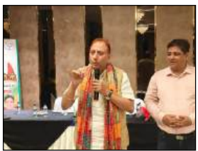
लोगों ने बताया कि लाजपत नगर मार्केट में अवैध पार्किंग की समस्या लगातार बढ़ रही है, जिससे दुकानदारों, ग्राहकों और स्थानीय निवासियों को भारी परेशानी का सामना करना पड़ रहा है। साथ ही पार्किंग के नाम पर मनमाने वसूली किए जाने की शिकायत भी सामने

दामोदर सावरकर का जन्म 28 मई 1883 को महाराष्ट्र के नासिक में हुआ था और उन्होंने स्वतंत्रता आंदोलन में महत्वपूर्ण भूमिका निभाई। इस दौरान सेंट्रल मार्केट लाजपत नगर के व्यापारियों और समर्पण आने वाली पीढ़ियों को प्रेरित करता रहेगा। उन्होंने बताया कि विनायक