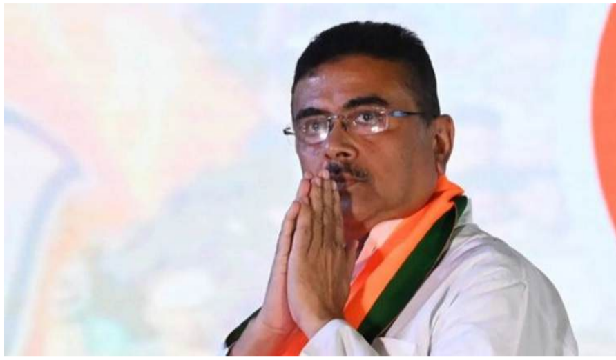
From TMC Rebel to Bengal CM: Suvendu Adhikari's Stunning Political Rise

Once considered one of Mamata Banerjee's closest confidants and a cen-