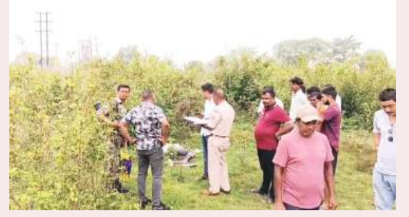
अज्ञात युवक का शव बरामद, हाथ पर मिला सांप काटने का निशान

व्यवस्था को लेकर समिति के सदस्य एवं जिला प्रशासन लगातार सक्रिय नजर आए। कथा स्थल पर स्वयंसेवकों की टीम श्रद्धालुओं के मार्गदर्शन एवं सहयोग में जुटी रही, जिससे पूरे आयोजन में अनुशासन एवं व्यवस्था बनी रही। कथा के बाद आयोजित भंडारा में भी बड़ी संख्या में श्रद्धालुओं ने प्रसाद ग्रहण किया। देर शाम तक श्रद्धालुओं की लंबी कतारें प्रसाद वितरण स्थल पर देखी गईं। पूरे आयोजन के दौरान सेवा भाव एवं धार्मिक उत्साह का अद्भुत दृश्य देखने को मिला। समिति के पदाधिकारियों ने बताया कि शिवमहापुराण कथा केवल धार्मिक अनुष्ठान नहीं बल्कि समाज में आध्यात्मिक चेतना, संस्कार और एकता का संदेश देने का माध्यम है। कथा के आगामी दिनों में श्रद्धालुओं की संख्या और अधिक बढ़ने की संभावना को देखते हुए तैयारियों को और सुदृढ़ किया जा रहा है। कथा के समापन के पश्चात श्रद्धालुओं ने भगवान शिव की आरती में भाग लिया तथा पूरे वातावरण में भक्ति और आध्यात्मिक ऊर्जा का अद्भुत दृश्य देखने को मिला।