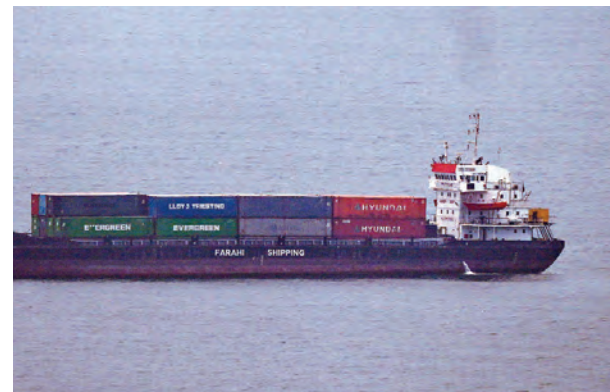
A cargo ship sailing in the Persian Gulf towards Dubai port as seen from Ajman, United Arab Emirates

Other participants will take part via videoconference, Macron's office said. European and other partners are ready to contribute to a "purely defensive mission aimed at restoring freedom of navigation in the Strait of Hormuz," the statement said. France and