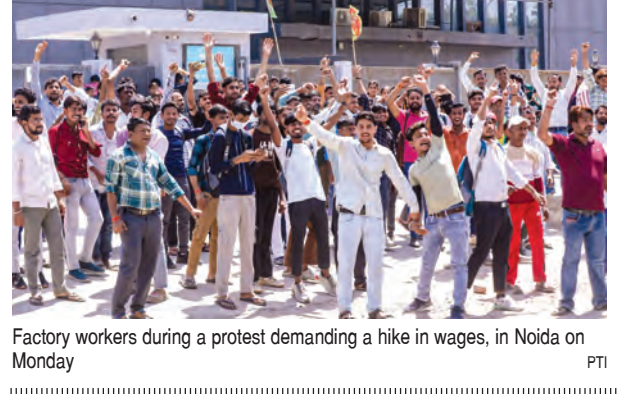
Factory workers during a protest demanding a hike in wages, in Noida on Monday