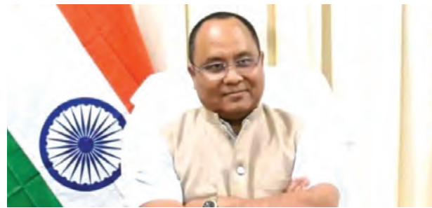
Tripura Forest Minister Animesh Debbarma

The party MLA alleged that Animesh Debbarma had purchased "two flats and a plot"