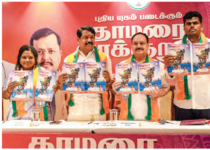
Union Minister JP Nadda with Tamil Nadu BJP leaders during the launch of the party manifesto ahead of the State Assembly elections in Chennai on Tuesday

Key promises include providing monthly assistance of ₹2,000 to