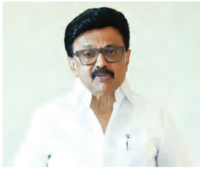
Chief Minister MK Stalin addressing a public meeting in support of party candidates ahead of the West Bengal Assembly elections at Samsernanj in Murshidabad on Tuesday

When such secrecy surrounds this process, it only strengthens the suspicion that a grave danger lies beneath.