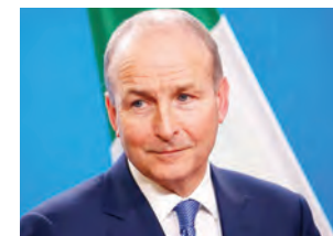
Prime Minister Micheal Martin

Protests began on April 7 with slow-moving convoys clogging roadways. They grew as word spread on social media as truckers, farmers and taxi and bus operators blocked key infrastructure and the main thoroughfare in the capital, Dublin. Demonstrators called