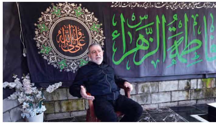
Wafiq Safa, senior Hezbollah political council member, speaking during an interview with The Associated Press in Beirut

It will be the first time in decades that envoys from Lebanon and Israel, which do not have diplomatic relations, meet face-to-face in direct talks. "As for the outcomes of this negotiation between Lebanon and the Israeli enemy, we are not interested in or concerned with them at all," Safa told The