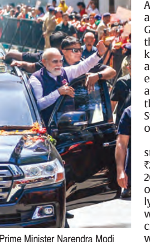
Prime Minister Narendra Modi holding a roadshow, in Dehradun on Tuesday

Expressways, road, rail and air networks decide the future of a nation, Prime Minister Narendra Modi said after inaugurating the Delhi-Dehradun Economic Corridor in Dehradun on Tuesday. The 213-kilometre economic corridor built at a cost of about ₹12,000 crore will cut the travel time between Delhi and Dehradun to about 2.5 hours. This economic corridor which also includes Asia's longest 12-kilometre elevated wildlife corridor, will benefit Delhi, Uttar Pradesh and Uttarakhand with