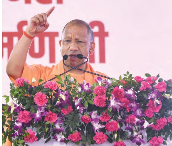
Saharanpur to Delhi and Dehradun will be faster, giving a new boost to connectivity and economic development in the region. Emphasising infrastructure-

UP Governor Anandiben Patel, Dy CMs Keshav Prasad Maurya and Brajesh Pathak, Bharatiya Janata Party state chief Pankaj Chaudhary, among others were present at the event in Saharanpur. They were virtually connected with the prime minister's event for the corridor inauguration taking place in Dehradun. The CM said, with the construction of this economic corridor, travel from