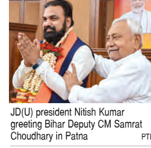
JD(U) president Nitish Kumar greeting Bihar Deputy CM Samrat Choudhary in Patna

Ending speculations, which involved leaders and their caste equations in Bihar, Deputy Chief Minister Samrat Choudhary was finally elected as the BJP legislative party leader in the State at the NDA meeting in Patna on Tuesday, paving the way for him to take oath as the next chief minister of the State. Choudhary's served in the RJD and the JD(U) for around 12 years before he joined the BJP in 2017. "For me, this is not merely a position, but an opportunity to serve the people of