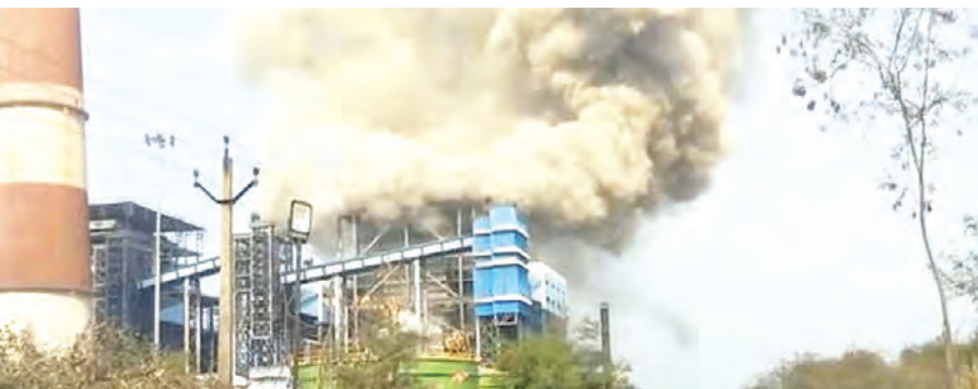
Smoke billows after an explosion at a power plant in Chhattisgarh's Sakti district

PRESS TRUST OF INDIA ■ Sakti (Chhattisgarh)