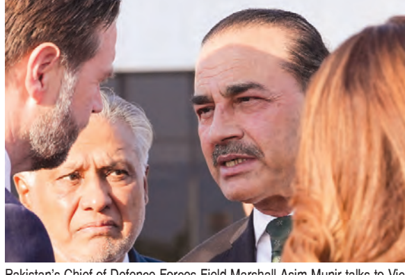
Pakistan's Chief of Defence Forces Field Marshal Asim Munir talks to Vice President JD Vance after attending talks with Iran in Islamabad

Pakistani officials said Tuesday that Islamabad has proposed a second round of talks to the US and Iran, while US Vice President JD Vance earlier said negotiations with Iran "did make some progress" and US President Donald Trump said Monday "we've been called by the other side" and "they want to work a deal." The Pakistani officials spoke on condition of anonymity because they were not authorised to discuss the matter with the press. French President Emmanuel Macron also urged the resumption of negotiations between the