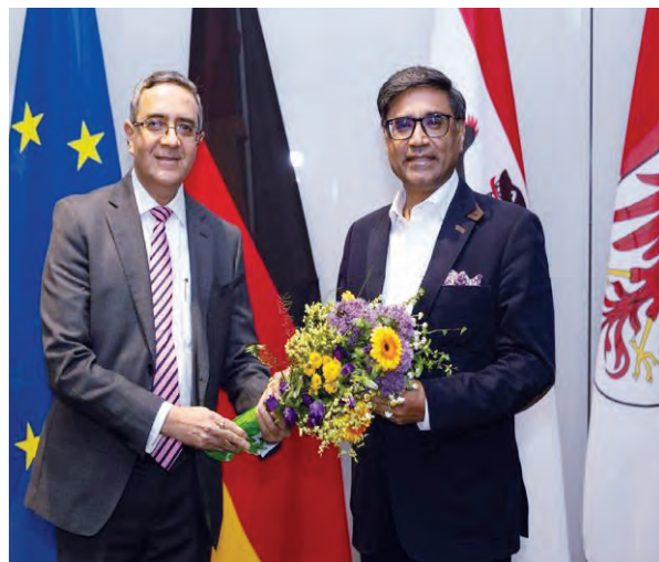
India and Germany, Office Consultations alongside Geza Andreas von Geyr, State Secretary of the German Foreign Office.

"The visit follows Chancellor Friedrich Merz's successful visit to India in January 2026 and reflects continued regular high-level exchanges between