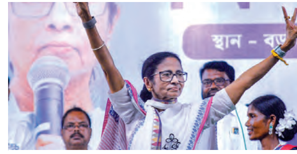
West Bengal Chief Minister Mamata Banerjee addressing a public meeting ahead of the Assembly election in Howrah on Tuesday