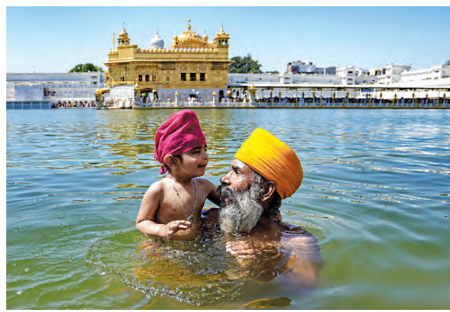
A man with a child takes a dip in the holy sarovar at Golden Temple on the occasion of Baisakhi, in Amritsar