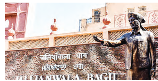
Lahore

A group of civil society members and lawyers on Monday paid tributes to those killed in the 1919 Jallianwala Bagh massacre at an event held at a court's premises in the capital of Pakistan's Punjab province.