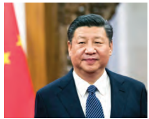
reception for Spanish Prime Minister Pedro Sanchez at the Great Hall of the People.

"We should strengthen communication, consolidate mutual trust, cooperate closely, oppose the world's retrogression to the law of the jungle, and jointly safeguard genuine multilateralism," said Chinese President Xi Jinping during a