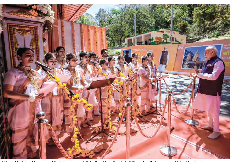
Prime Minister Narendra Modi during a visit to the Maa Daat Kali Temple, Saharanpur, Uttar Pradesh

Prime Minister Narendra Modi on Tuesday reached out to all the political parties to ensure the smooth passage of the amended Women's Reservation Act in Parliament later this week for its implementation in the 2029 elections. Addressing a public rally, the PM recalled that after four decades of waiting, Parliament had passed the Nari Shakti Vandan Adhinyam, guaranteeing 33 per cent reservation for women in the Lok Sabha and State Assemblies. He announced that a special discussion has been scheduled in Parliament from April 16 to take this forward. PM Modi urged political parties to support amendment to the Constitution to ensure the law comes into effect from the 2029 General Election without further delay. The proposed