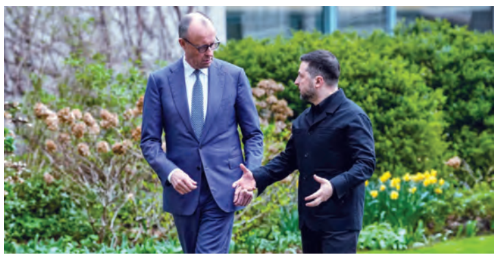
German Chancellor Friedrich Merz welcomes Ukraine's President Volodymyr Zelenskyy for German-Ukrainian Government consultations in Berlin Germany

Merz said that Germany's commitment to supporting Kyiv's war effort is "a very clear signal" to