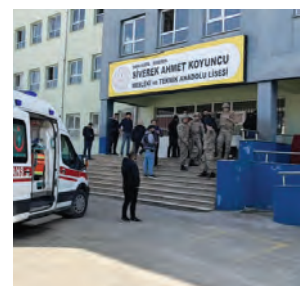
■ Ankara

A former student opened fire at a high school in southeast Türkiye on Tuesday, wounding at least 16 people before killing himself, an official said.