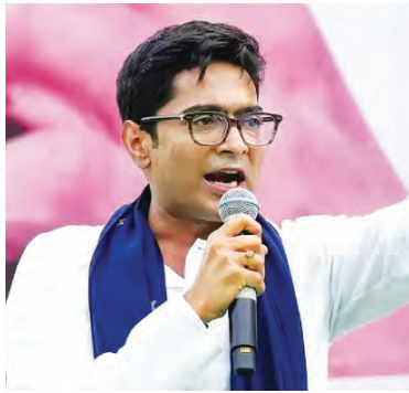
Senior Trinamool Congress leader Abhishek Banerjee speaking at a gathering after a roadshow in north Bengal's Cooch Behar

"They have persecuted and tormented Bangla-speaking people in BJP-ruled States. They have insulted our icons, belittled our culture, tried to dictate our food habits, questioned the legitimacy of our language, and above all, conspired to rob the people of their