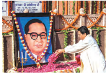
Saheb Dr Bhimrao Ambedkar" on his birth anniversary.

In a post on X, the BSP chief highlighted Dr BR Ambedkar's role in uplift of the Bahujan Samaj and praised him for embedding the principles of equality in the Indian Constitution. In her post, Mayawati offered her "profound salutations and floral tributes" to the messiah of Bahujans, Bharat Ratna Bodhisattva, the most revered Baba