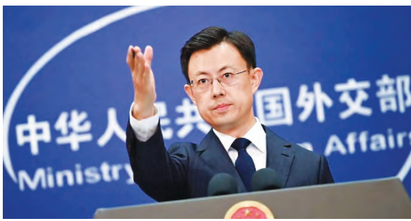
Chinese Foreign Ministry spokesperson Guo Jiakun

New Delhi's sharp reaction came against the backdrop of Beijing establishing a third new administrative county in Aksai Chin, a