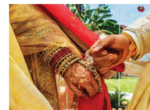
PRESS TRUST OF INDIA ■ Peshawar

Pakistan's Khyber Pakhtunkhwa provincial Government has amended the Hindu Marriage Act 2017 to simplify and streamline the process of registering Hindu marriages at the local level, an official said.