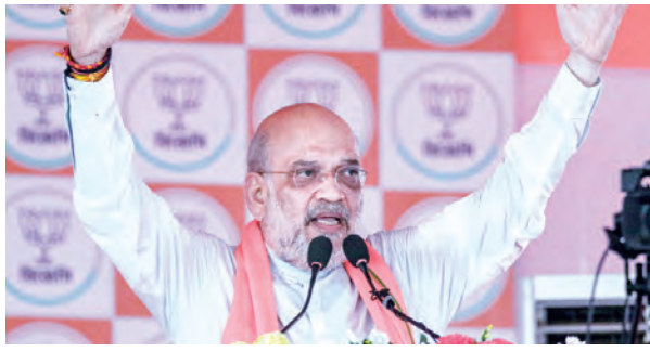
Union Home Minister Amit Shah addressing the gathering during a public meeting in support of BJP candidates ahead of the West Bengal Assembly elections at Gochhar in Dakshin Dinajpur on Tuesday

The century-old demand of the Nepali-speaking Indians in the Darjeeling hills for a separate State of Gorkhaland has