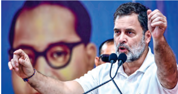
LoP in the Lok Sabha and Congress leader Rahul Gandhi addressing a public meeting in support of party candidates ahead of the West Bengal Assembly elections at Samsernanj in Murshidabad on Tuesday

"Chief Minister Mamata Banerjee promised jobs to