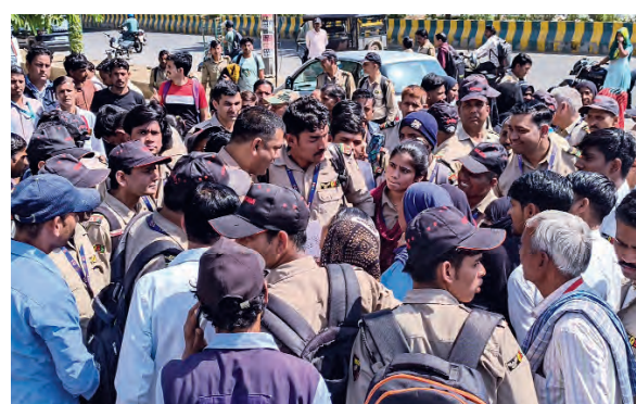
Security guards stage a protest over fee hike issues outside a residential society at Sector 74 in Noida

In a sharp escalation of the industrial unrest that has gripped the region, the Polit Bureau of the CPI(M) condemned the police action in Noida, Greater Noida, and Gurugram. The party alleged that the State machinery is being used to