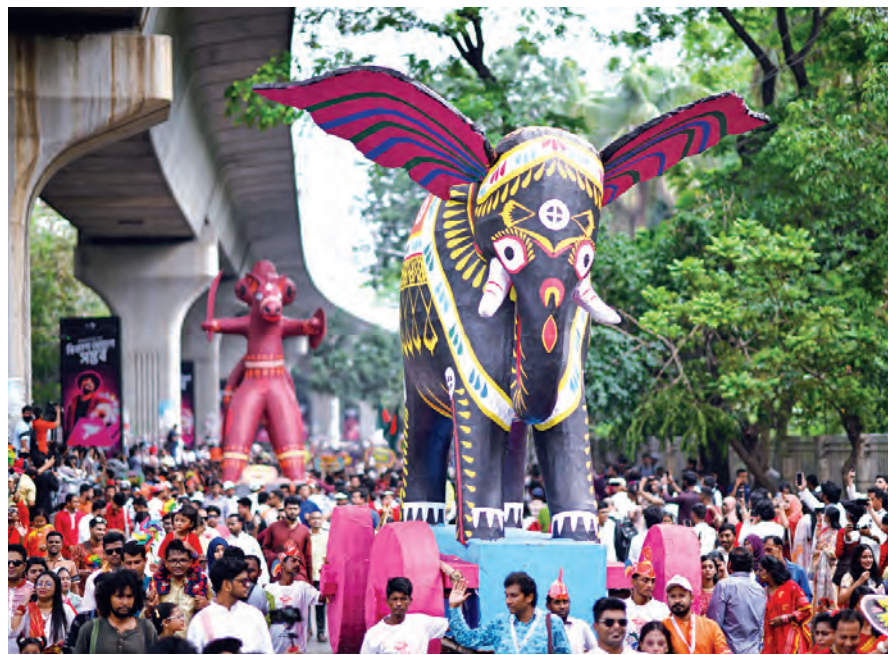
People participating at the Baishakhi Shobhajatra procession to celebrate the first day of the Bangla New Year in Dhaka, Bangladesh

Trump overnight said he didn't think Leo was doing a good job as pope and suggested he should "stop catering to the Radical Left." Leo responded by saying his appeals for peace and reconciliation are rooted in the Gospel, and that he didn't fear the Trump administration. (AP)