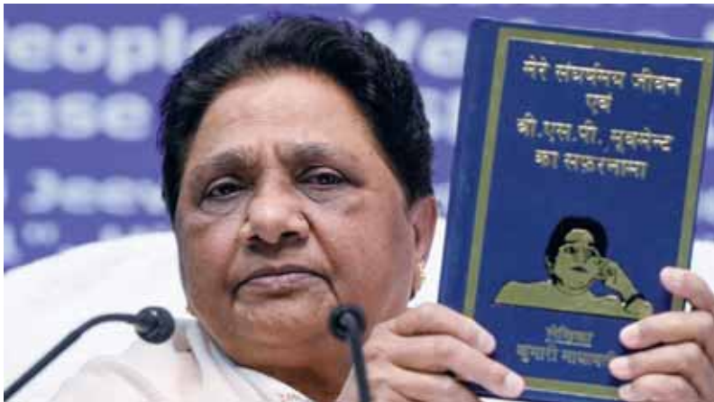
BSP chief Mayawati addressing a press conference marking her 70th birthday, at the Bahujan Samaj Party (BSP) headquarters in Lucknow

Mayawati accused previous Governments of neglecting BSP founder Kanshi Ram, alleging that national mourning was not declared after his death. She also alleged injustice towards Muslims and other com-