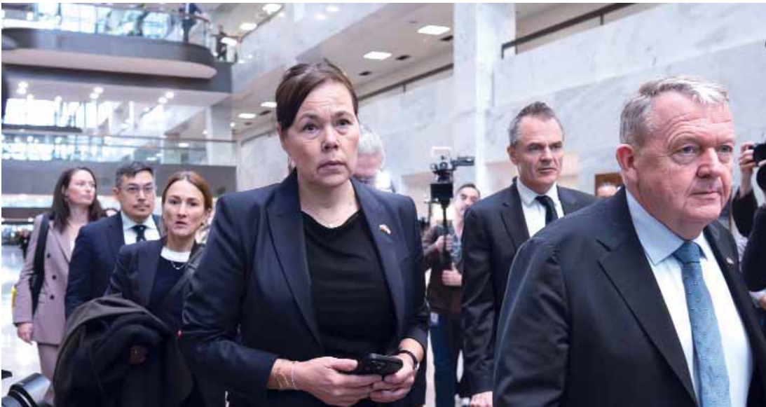
Greenland Foreign Minister Vivian Motzfeldt and Danish Foreign Minister Lars Løkke Rasmussen arriving on Capitol Hill to meet with members of the Senate Arctic Caucus in Washington

Danish Foreign Minister Lars Løkke Rasmussen, flanked by his Greenlandic counterpart Vivian Motzfeldt, said Wednesday that a "fundamental disagreement" over Greenland remains with Trump after they held highly anticipated