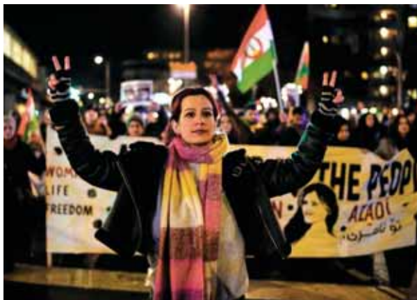
Protesters participate in a demonstration in support of the nationwide mass protests in Iran against the government, in Berlin, Germany

A day ago the Indian Embassy in Iran asked all nationals — including students, pilgrims, businesspersons and tourists — to leave the country using available means, including commercial flights and now New Delhi is drawing up contingency plans to bring back Indian nationals from Iran as the security and political situation there remains volatile, with officials keeping a close watch on developments amid fears of possible US military action, sources familiar with the matter said on Thursday. Officials estimate that around 10,000 Indians are currently in Iran, a significant proportion of them students enrolled in universities and religious institutions across the country. Any evacuation effort, if activated, is expected to prioritise students, who are considered particularly vulnerable given the uncertainty on the ground. The Indian embassy in Tehran has begun efforts to assess how many Indians wish to return. CONTINUED ON >> P4