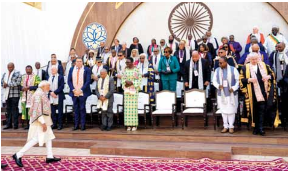
Prime Minister Narendra Modi, Lok Sabha Speaker Om Birla and others during the 28th Conference of Speakers and Presiding Officers of Commonwealth Countries (CSPOC), at the Parliament House Complex, in New Delhi

House Complex, Modi highlighted India's effort to ensure that innovations benefit the entire Global South and the Commonwealth countries. He noted that India is also building open-source technology platforms so that partner nations in the Global South can develop systems similar to those established in India. Highlighting that one of the key objectives of the CSPOC is to explore different ways of promoting knowledge and understanding of parliamentary democracy, Modi stressed that both Speakers and Presiding Officers have a very important role in this effort, as it connects people more closely with the democratic process of their country. Speaker of the Lok Sabha,