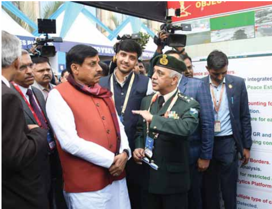
Madhya Pradesh Chief Minister Mohan Yadav visits an exhibition at Regional Artificial Intelligence Impact Summit-2026, in Bhopal on Thursday.