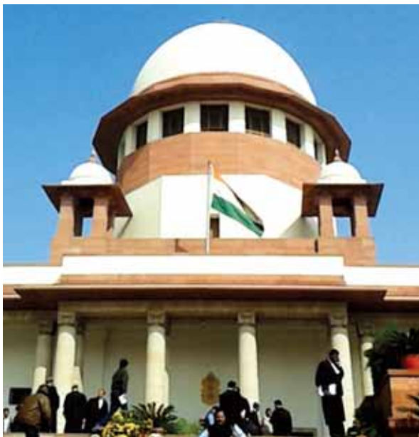
The SC also observed that a central agency has no power to interfere with the election work of any party