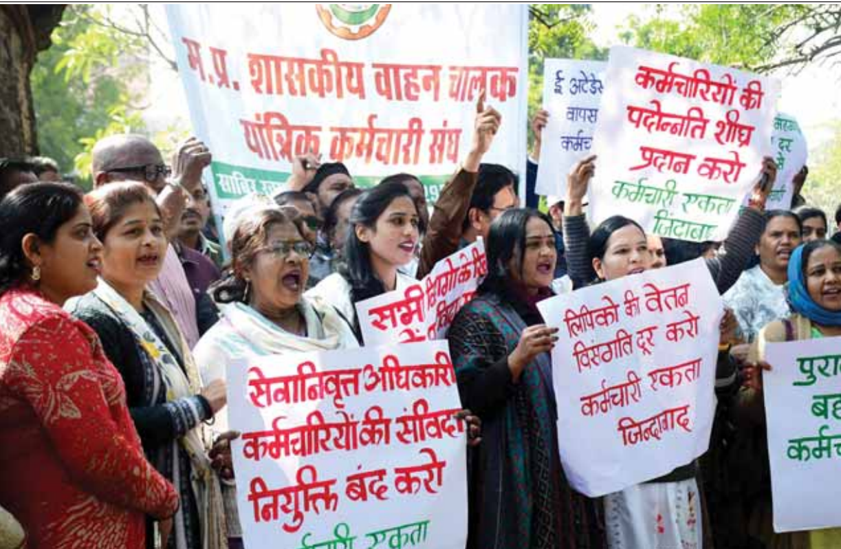
Madhya Pradesh State Government contractual and outsourced employees stage a protest over discrepancies in the wages of clerks demanding for regularisation of their jobs including several other demands at the State Mantralaya in Bhopal on Thursday.

directions for ministers to be present at the party's state office on designated days every month to listen to workers' concerns and public-related issues. He added that the core objective of the initiative is to understand these issues and make sincere efforts towards their resolution. The minister said the initiative, introduced in the form of a 'Cooperation Cell', has already begun yielding positive outcomes. He noted growing enthusiasm among party workers, with large numbers visiting the BJP state office to raise issues and offer suggestions. Despite ministers' demanding schedules, including official meetings and field visits, the system has brought clarity for party workers regarding access to ministers, he said, adding that the initiative is serving as a strong bridge between the organisation and the government.