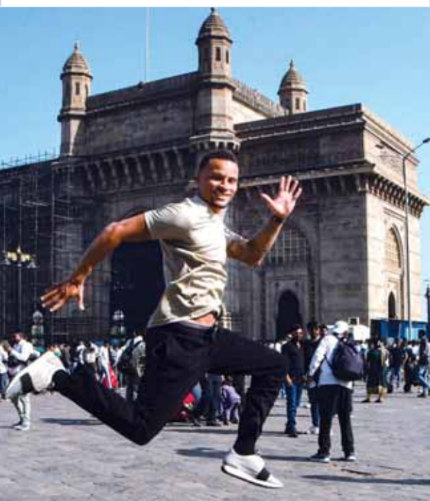
Andre De Grasse, International Event Ambassador for the Tata Mumbai Marathon 2026 at the Gateway of India in Mumbai