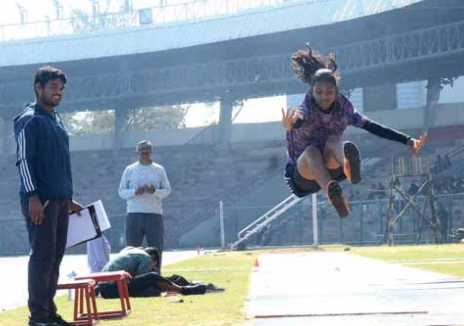
A girl athlete in action during a long jump event during ongoing MP Khelo Youth Games, at TT Nagar Stadium in Bhopal on Thursday.