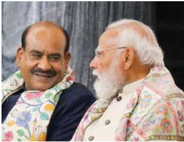
PM Narendra Modi, right, and Lok Sabha Speaker Om Birla during the 28th Conference of Speakers and Presiding Officers of Commonwealth Countries (CSPOC), at the Samvidhan Sadan in New Delhi on Thursday

Addressing the gathering in the presence of the prime minister and Rajya Sabha Deputy Chair Hariwansh, Birla said today the world is under-