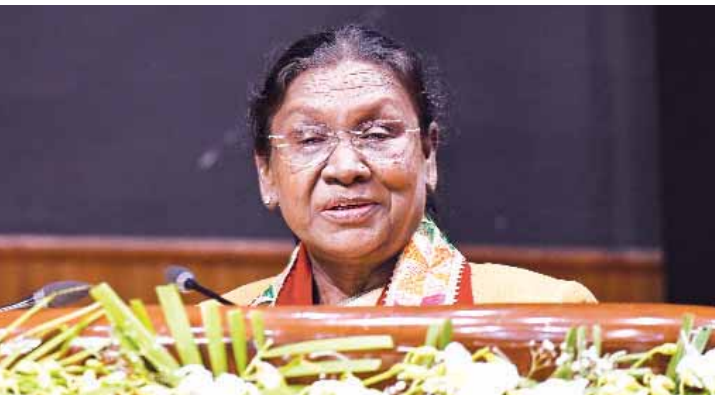
President Droupadi Murmu speaks during the 50th annual convocation ceremony of Guru Nanak Dev University, in Amritsar

educational institutions like Guru Nanak Dev University is crucial. All stakeholders of this university should make every possible effort to guide the youth in the right direction,” she said. Addressing the students in the gathering, the president advised them to remember that education is not merely a means of livelihood. It is also a means of serving society and the nation. She said that they owe a debt to society, which has contributed to their education. Making efforts to uplift those who have been left behind in the development journey can be one of the ways of repaying the debts. The president said that after completing formal education, students will embark on their journeys in different directions. Some will serve in the Government or private sector, others will pursue higher education or research, while many will establish their own ventures or build their careers in teaching, she said. While each field requires different types of qualifications and skills,