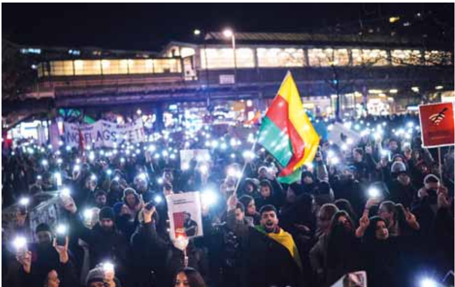
Protesters participating in a demonstration in support of the nationwide mass protests in Iran against the Government in Berlin, Germany

“Since January 8, we saw a full-fledged war and anybody who was in the gathering since then is a criminal,” said