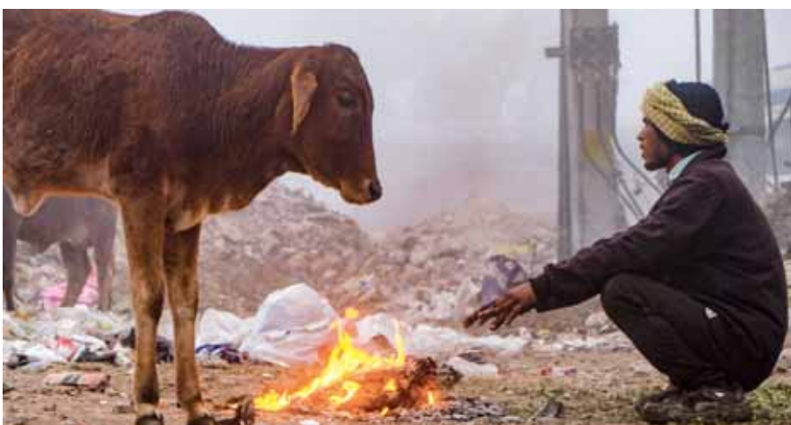
A man extends his hands towards a makeshift fire to keep himself warm on a cold winter morning, in Gurugram. At 2.9 degrees Celsius, Delhi logged its coldest morning of the season. The bone-chilling conditions weren't confined to the northern region alone. Eastern states of West Bengal and Jharkhand, too, experienced intense cold.