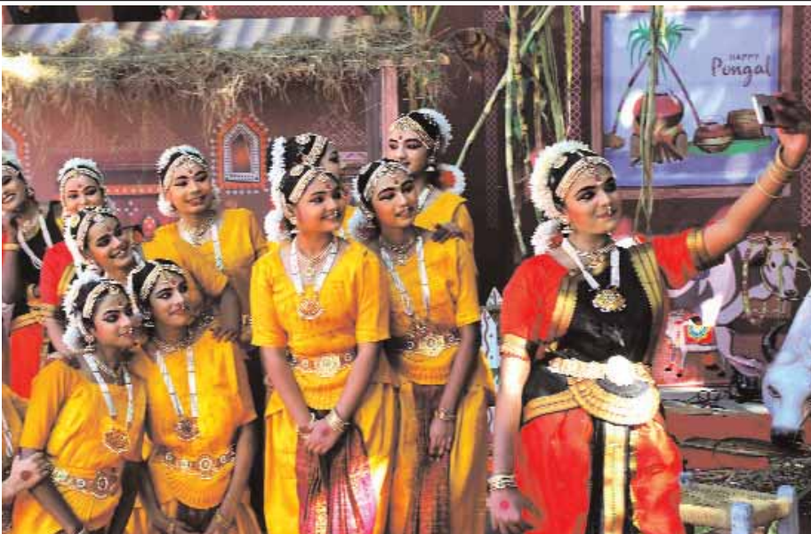
Artists take a selfie during the Pongal celebration programme organised by MP State Tourism Development Corporation (MPSTDC) in Bhopal on Thursday.