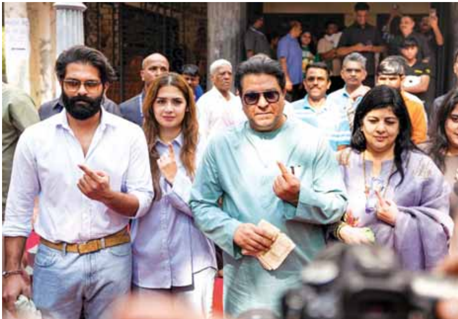
MNS chief Raj Thackeray with party leader and his son Amit Thackeray and other family members, showing his ink-marked finger after casting a vote in the BMC polls in Mumbai

All exit polls predicted a clear sweep for the BJP-Shiv Sena alliance in Brihanmumbai Municipal Corporation (BMC) polls, which took place on Thursday, and a defeat of the Shiv Sena (UBT)-Maharashtra Navnirman Sena. According to My Axis India exit polls, the BJP-Shiv Sena alliance is poised to win 131-151 seats and garner 42 per cent of vote share in the country's commercial capital. The Shiv Sena (UBT)-MNS-NCP (SP) alliance of Uddhav Thackeray and Raj Thackeray is expected to win 58-68 seats and get a vote share of 32 per cent. The Congress-Vanchit Bahujan Aghadi and Rashtriya Samaj Paksha alliance is expected to win 12-16 seats with a vote per cent of 13 per cent. Others, which comprise independents and small players like NCP, AIMIM, and the left parties, are likely to win 6-12 seats, it said. There are 227 wards in Mumbai. The Saam TV exit polls have predicted that the BJP is likely to win 84 seats, while its alliance partner Shiv Sena could bag 35 seats in Mumbai. Shiv Sena (UBT) and the MNS will get 65 and 10 seats, respectively. NCP (SP), which is part of the Sena