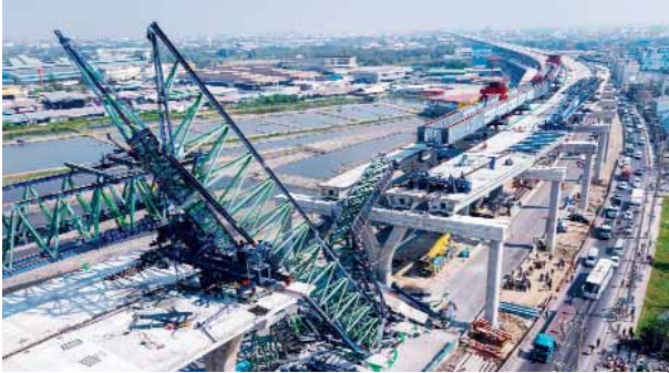
Construction crane collapsed on the Rama 2 Road elevated expressway

The work on an extension of the Rama 2 Road expressway — a major artery leading from Bangkok — has become notorious for construction accidents, some of them fatal. The crane collapsed at part of the road project in Samut Sakhon province, trapping two vehi-