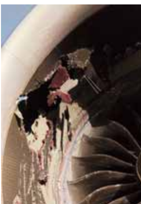
Damaged part of the engine of an Air India A350 aircraft

In a rare incident of its kind, Air India's newest Airbus A350, operating a Delhi-New York flight with over 250 passengers on board, sustained engine damage after ingesting an improperly secured baggage container while taxiing to its parking bay at Indira Gandhi International (IGI) Airport amid dense fog on Thursday morning. The aircraft had to return to Delhi after takeoff due to the sudden closure of Iranian airspace. Then, while taxiing to the parking bay at IGI Airport,