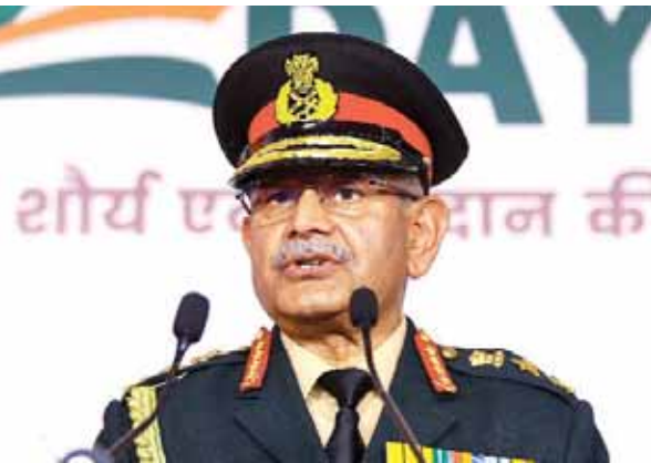
Chief of the Army Staff (COAS) General Upendra Dwivedi addresses the media after the 78th Army Day Parade celebration, in Jaipur, Rajasthan

and precision. The operation reflected a mature and confident force, capable of safeguarding national interests through measured, firm and responsible action,” he said. “We are not just addressing current challenges but also preparing for future wars. New structures are being created in this direction, which are being equipped and trained according to future needs,” he said. He said that new units like the Bhairav Battalion and Shakti Baan Regiment have been raised. “This reflects the creation of an agile, responsive, and mission-oriented Army, aligned with future challenges,” he said. He said that today’s parade showcased a beautiful blend of tradition and transformation. “The Nepal Army Band reflected our strong ties, while the new units demonstrated the Army’s emerging strength,” he said. “The Indian Army is fully prepared at all times for any