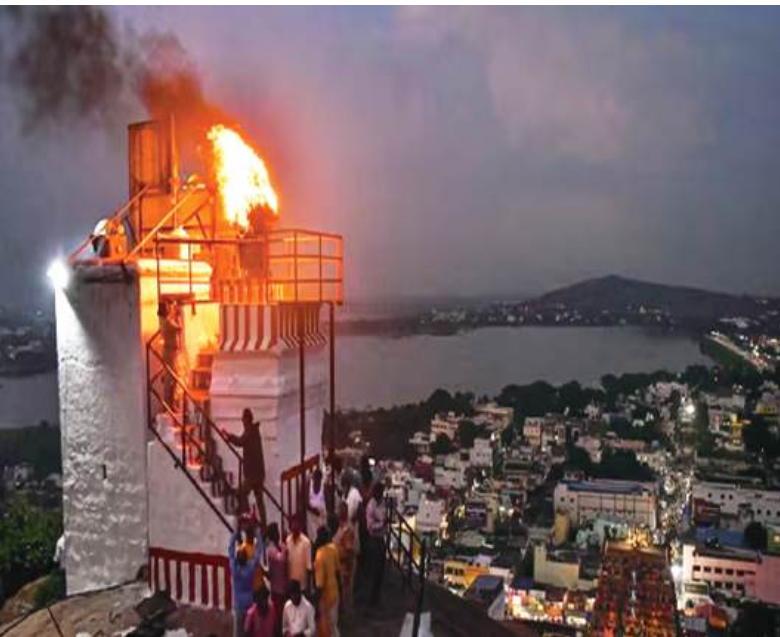
Deepa Mandapam, a ritual carried out for several years. The state government chose