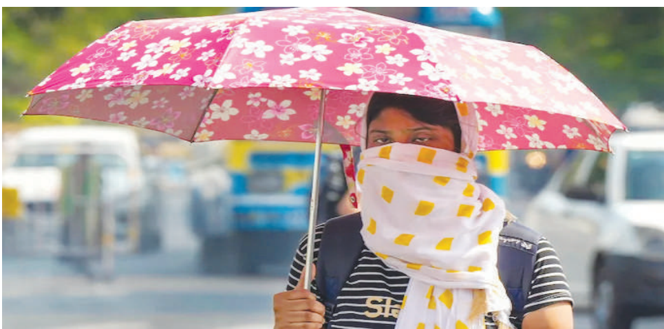
the state's Nandyal city. Meanwhile, the third-highest temperature on Monday was 44.8 degrees Celsius recorded in Odisha's Baripada, followed by Sheikhpura in Bihar with the fourth-highest at 44 degrees Celsius. According to the IMD,

New Delhi: The India Meteorological Department (IMD) has issued a red alert for the states of Andhra Pradesh, Bihar, West Bengal and Odisha for the next two to three days due to a heatwave. Parts of the country are already reeling under intense heat due to which government agencies have issued health warnings, while some states have suspended classes. In its latest weather bulletin issued on Monday night, the weather office said "intensely hot conditions" are expected in east India until Wednesday, while it will continue in the south peninsular region for the next five days. The IMD has also issued an orange alert for parts of Telangana, Karnataka and Sikkim. On Monday, a heatwave prevailed in parts of West Bengal, Gujarat, Bihar, Sikkim, Odisha, Jharkhand, Kerala and Andhra Pradesh. Andhra Pradesh's Kalaikunda and Kandala recorded a maximum temperature of 45.4 degrees Celsius, which was eight notches above normal, while it was 45 degrees Celsius in