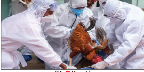
DN ■ Ranchi

Situation regarding flu is normal, there is no need to panic - Central Medical Team