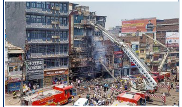
by Suresh Pd Nikhar

Patna: A tragic fire engulfed a hotel in Patna, Bihar, claiming the lives of several individuals and injuring many others. The fire, which began at the Pal Hotel, quickly spread to neighboring buildings before being brought under control by firefighters. The incident resulted in the death of at least six people, with several others critically injured and receiving treatment at a local hospital. Firefighters worked tirelessly for over three hours to extinguish the blaze and rescue over 20 individuals trapped in the hotel. The cause of the fire is still under investigation, and authorities are yet to determine the identities of the deceased. Senior Superintendent of Police, Rajeev Mishra, stated that the injured are being rushed to the hospital for medical attention. The fire started in Hotel Pal and later spread to Hotel Amit and other nearby buildings. Officials have confirmed the recovery of one body from Hotel Pal and the remains of a mother and daughter from Hotel Amit. Fire brigade officials deployed seven to eight fire tenders to control the blaze, which also resulted in the destruction of several vehicles in the vicinity. DIG (Fire), Mrityunjay Kumar Chaudhary, assured reporters that a thorough investigation would be conducted to determine the cause of the fire.