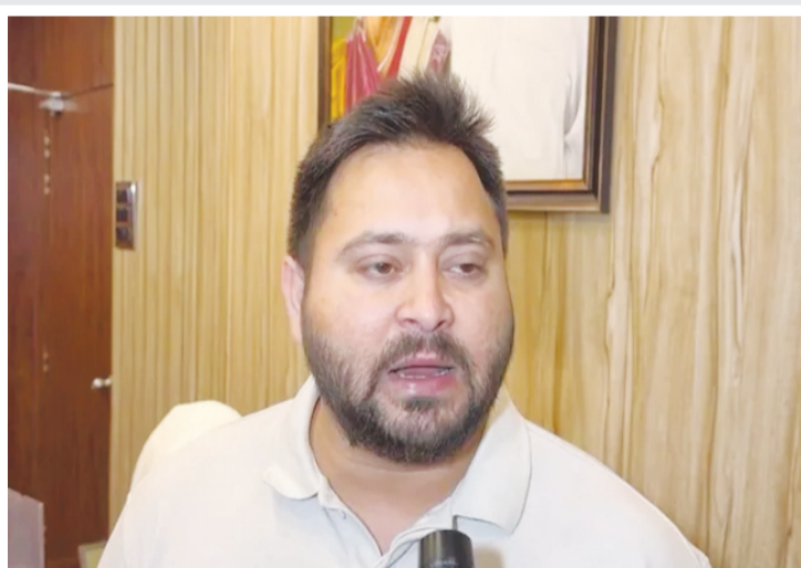
Now, the public is tired of their statements and false promises. We have promised that we will give a special package to Bihar along with special status," he added. The former deputy chief minister also

Patna: After the first phase of the Lok Sabha elections, Rashtriya Janata Dal (RJD) leader Tejashwi Yadav on Saturday said that the BJP's "400 paar" film has become super flop on the first day itself. He Mahagathbandhan is winning all four seats in the first phase. We have held block-wise meetings and the feedback has been very good. The BJP's "400 paar" film has become a super flop on the first day itself. The people of Bihar are aware and will teach them a lesson," he said. Mr Yadav told ANI that there is no competition in the first phase as Bihar will give shocking results this time.