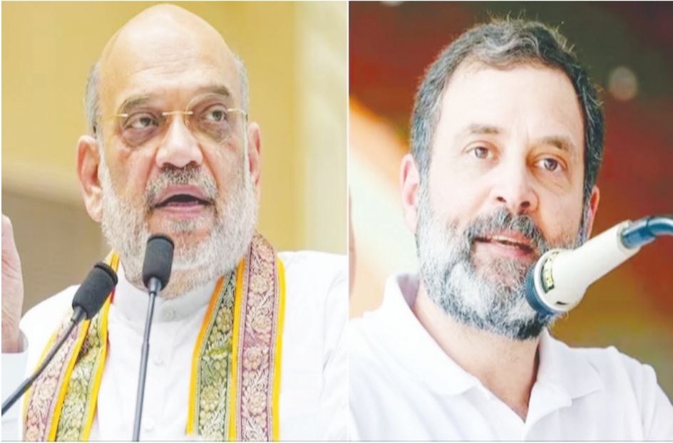
the roadshow. Voting for 12 Lok Sabha seats in Rajasthan was held in the first phase of Lok Sabha polls on Friday. Elections in the remaining 13 constituencies are scheduled to be held on