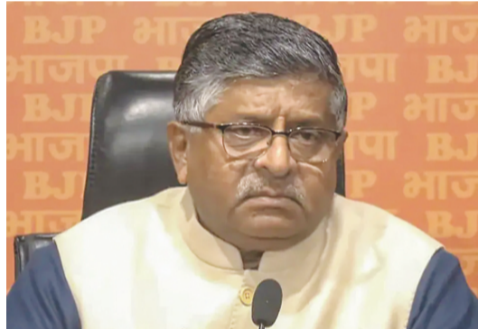
constituencies spread over 21 states and Union Territories was held on Friday. Speaking at a press conference here, he said, "We talk of '400 paar,' and now there are indications that the figure can go even further...The opposition is showing signs of frustration at defeat; they say only one thing: the

Ravi Shankar Prasad said that there are indications that the BJP-led National Democratic Alliance (NDA) will secure over 400 seats in the Lok Sabha elections.