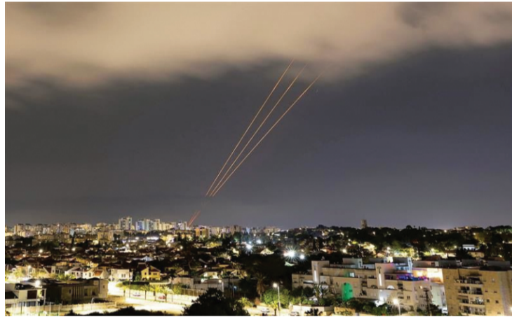
the Israeli territory, Iran declared through its Permanent Representative to the UN that its retaliation had 'concluded', and warned Israel not to respond. Apart from

After the April 1 bombing, the Iranian leadership had vowed revenge, with Ayatollah Ali Khamenei declaring that Israel would be 'punished' for it. On Sunday, having demonstrated that it had the capability to hit deep inside